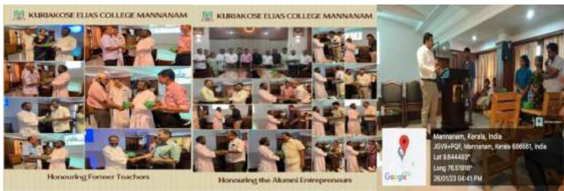
Interaction of alumni entrepreneurs with students